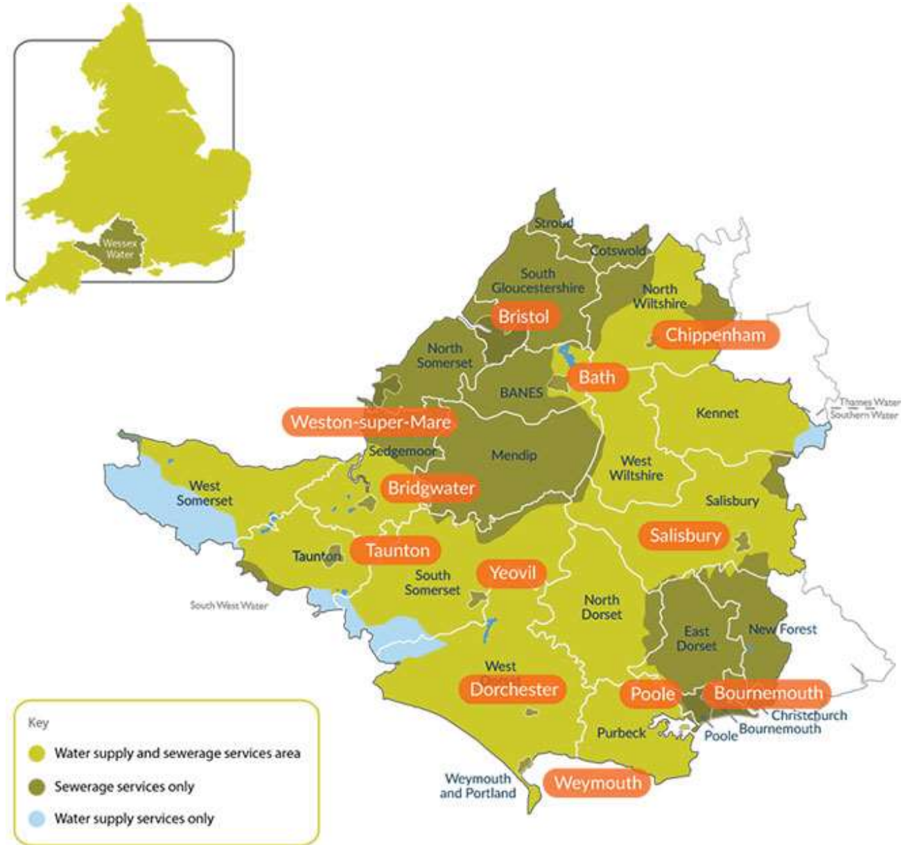
Figure 2: Our business

We supply water and wastewater services to more than 2.8 million customers in an area covering around 10,000 km 2 .